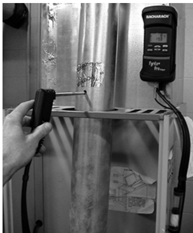
80+ Furnace: Measure draft and sample flue gases in the vent connector above the furnace.