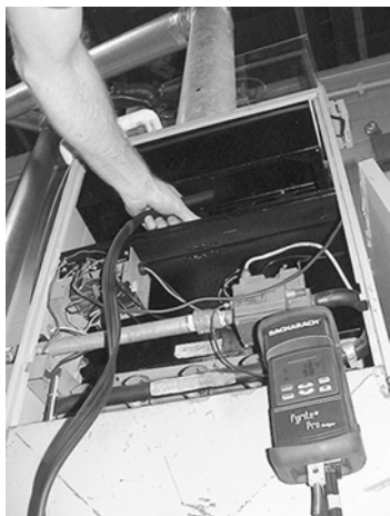
70+ Furnace: Sample flue gases within the draft diverter inside each exhaust port.